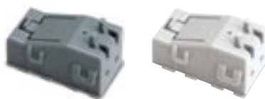
Two-station modules (available in standard and high-surge) provide great flexibility