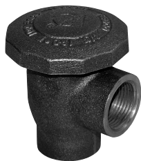
715 1/2" - 3/4" (15-20mm)