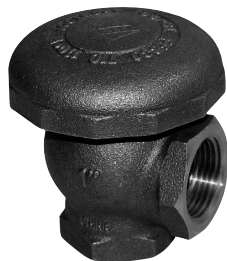
710 1" - 2" (25-50mm)